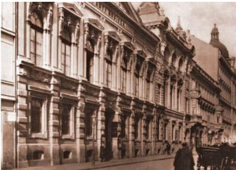
Nada Bezić, The Hrvatski glazbeni zavod (Croatian Music Institute) in the 1920s: Jutarnji koncerti (Morning Concerts) and Intimne muzičke večeri (Intimate Musical Evenings)

Nada Bezić offers a perspective on meta-nationalism in “ The Hrvatski glazbeni zavod (Croatian Music Institute) in the 1920s: Jutarnji koncerti (Morning Concerts) and Intimne muzičke večeri (Intimate Musical Evenings) ,” a study on the history of the Croatian Music Institute in Zagreb (Hrvatski glazbeni zavod) during the 1920s. Bezić focuses mainly on the institute’s concert series and describes the program policy of the series as a turn to “Yugoslav music.” The promotion of Yugoslav music was a continuation of the pan-Slavic, that is, south Slavic, cultural policy promoted by the National Movement (Ilirski pokret) in nineteenth-century Croatia.