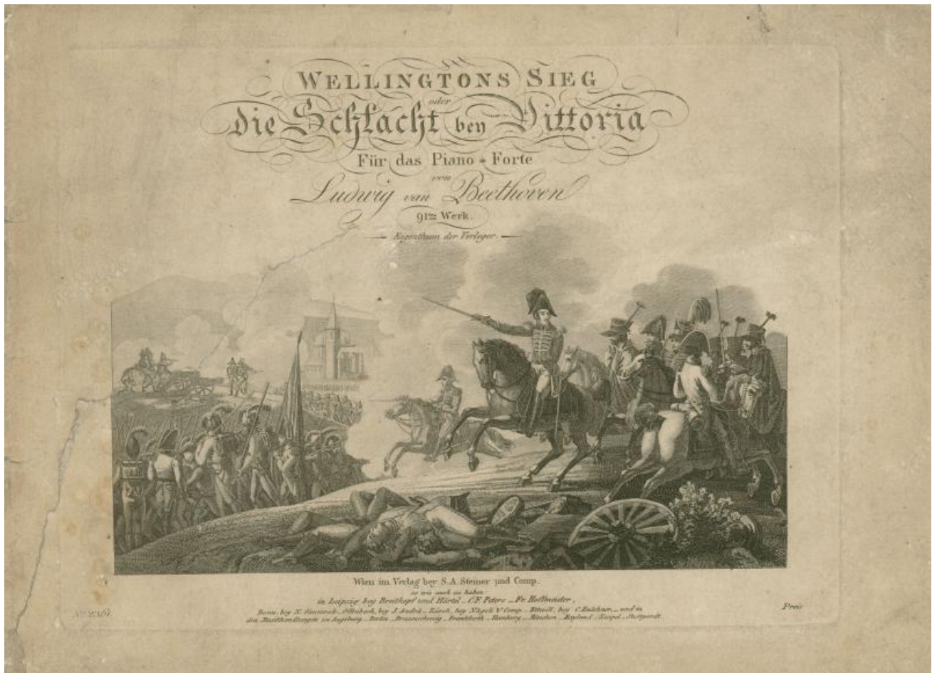
Figure 2: Title page from the piano part in the 1816 piano trio arrangement of Wellington's Victory , issued by S. A. Steiner & Co.

[4] But in general reviewers of Beethoven's symphonies from the Eroica onwards tended to emphasize difficulties for the performers and listeners in the latest works, wishing that Beethoven would stay with the model of the earlier symphonies (and that of Haydn and Mozart). An 1827 reviewer of a performance of Beethoven's Seventh Symphony was troubled by the length and complexity of the work, as was typical: