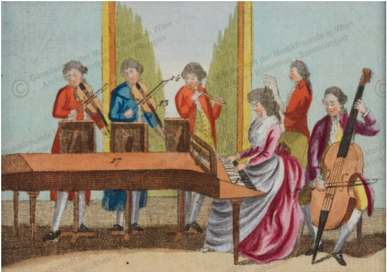
Figure 3: “Chamber music,” colored etching by Clemens Kohl after Johann Sollerer, Vienna 1793, showing a sextet of five male musicians seated around a woman at a fortepiano;

© Sammlungen der Gesellschaft der Musikfreunde in Wien, shelfmark Bi 1815