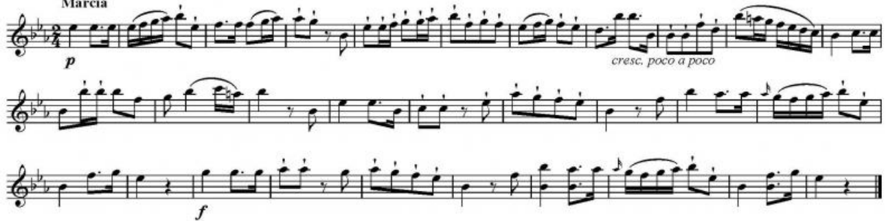
Example 4: Excerpt from the first violin in the 1816 quintet arrangement of Wellington's Victory , issued by S. A. Steiner & Co.