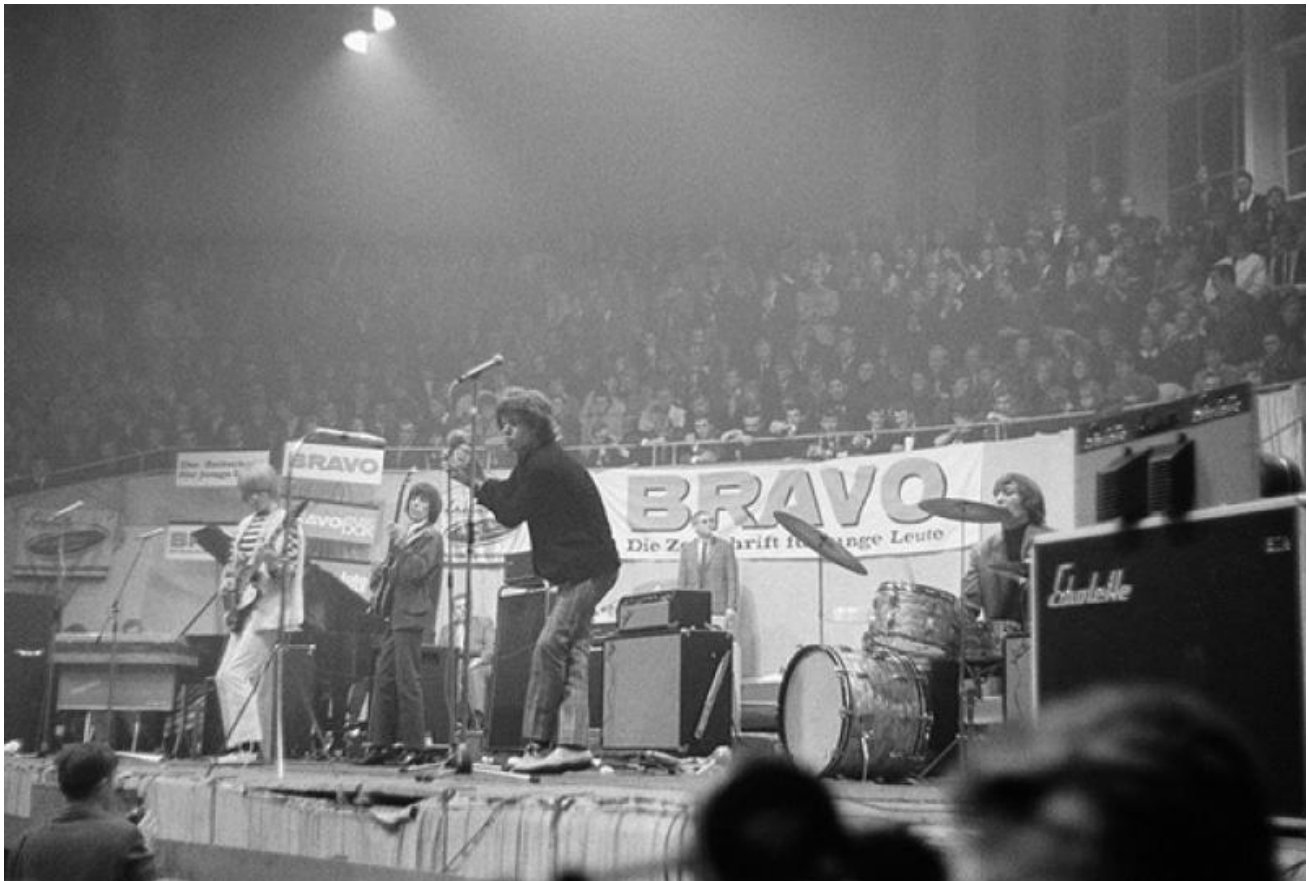
Figure 2: Part of the curriculum? Music history auditorium featuring the Rolling Stones, September 11, 1965

[3] At the same time, the volume reminds us, for one, that music history is not just the domain of musicologists, and, moreover, that musicology as an independent subject is by no means a worldwide standard. Leaving aside Mike Searby's assumption that the latter is a specific feature of the United Kingdom (see 240–41), this is rather the exception. Actually, one ought not forget that musicology is a result of the bourgeois academization of the nineteenth century, especially in the Austro-German area, while elsewhere the subject is mostly treated in the form of music history as a subfield of more practice-oriented musical studies.