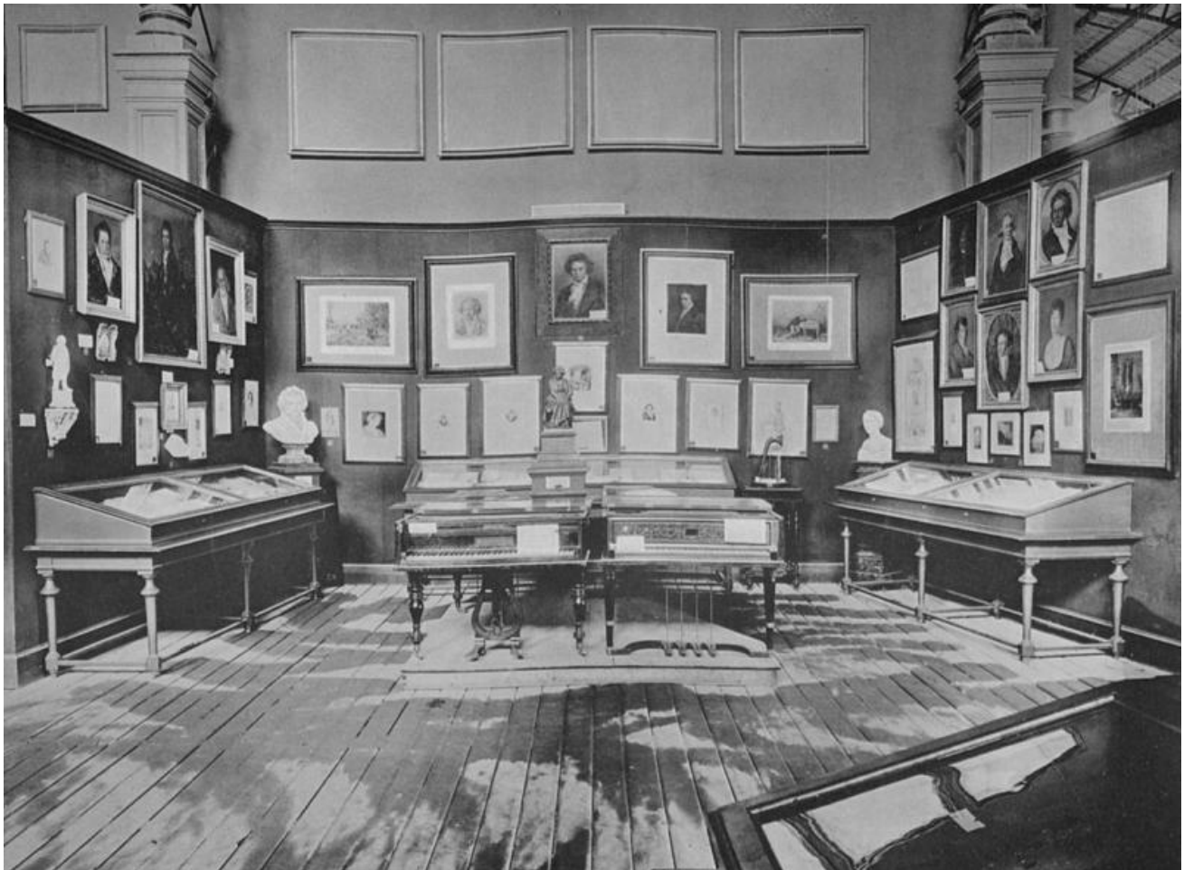
Figure 7: Beethoven interior, depicted in Schneider, Internationale Ausstellung Wien 1892, 95