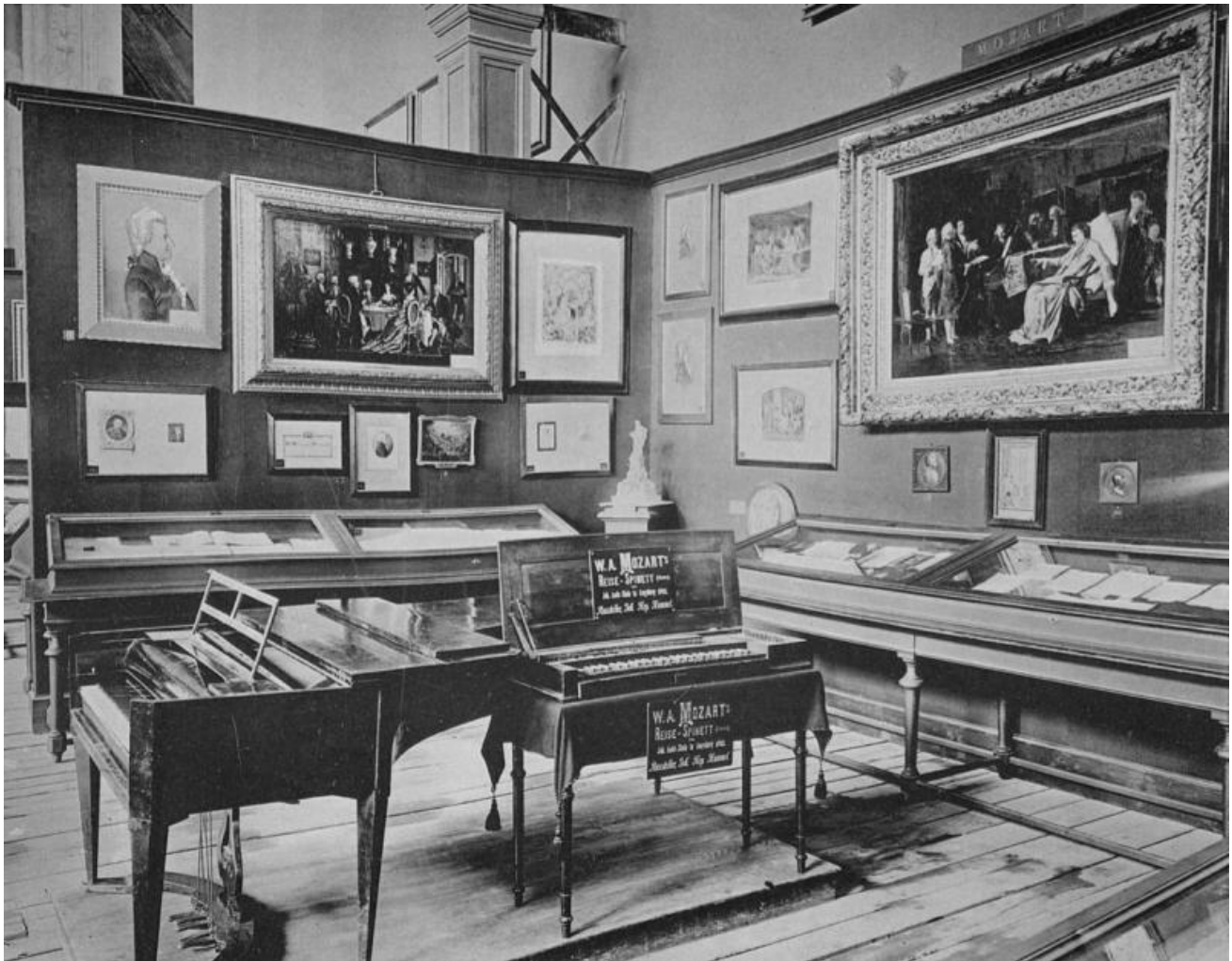
Figure 6: Mozart interior, depicted in Schneider, Internationale Ausstellung Wien 1892 , 87