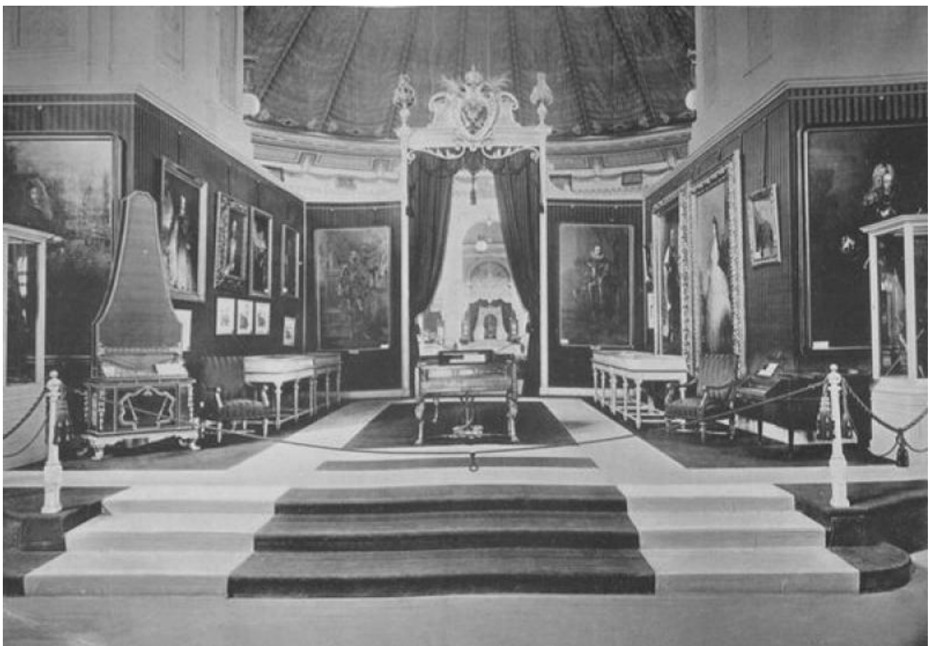
Figure 5: Habsburg-Lorraine interior depicted in Siegmund Schneider, Die Internationale Ausstellung für Musik- und Theaterwesen Wien 1892 (Vienna: Moritz Perles, 1894), 33

Furthermore, the autograph is enclosed in a display case, which is not only a curatorial practice, or for that matter, a "narrative device." This gives it an artificial aura by highlighting its worth, and it therefore must be "locked up." From a semiotic perspective, the exhibited object refers to itself, being a piece of music (iconicity), reminds us of the famous and historically relevant "author" (indexicality), and functions as a symbol for nationalism/patriotism (symbolicity). [40] "Auratic radiance" is the product of either exhibitionary performativity or the cultural and historical knowledge of the object. Often, both of these spheres are combined in exhibitions to add "a halo of meaning." Furthermore, knowing the history and cultural relevance of Haydn's Volkshymne and placing it in a display case creates what Greenblatt adroitly calls "resonance" and "wonder," and this also becomes manifest in the quoted passage above. The displayed object "evoke[s] in the viewer the complex dynamic cultural forces from which it has emerged," and it exerts the power "to stop the viewer in his tracks, to convey an arresting sense of uniqueness, to evoke an exalted attention." [41]