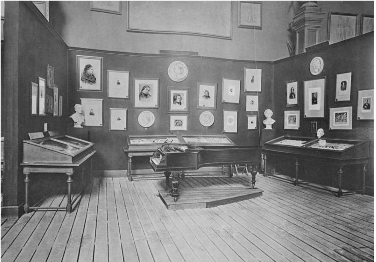
Figure 9: Schumann interior, depicted in Schneider, Internationale Ausstellung Wien 1892 , 125