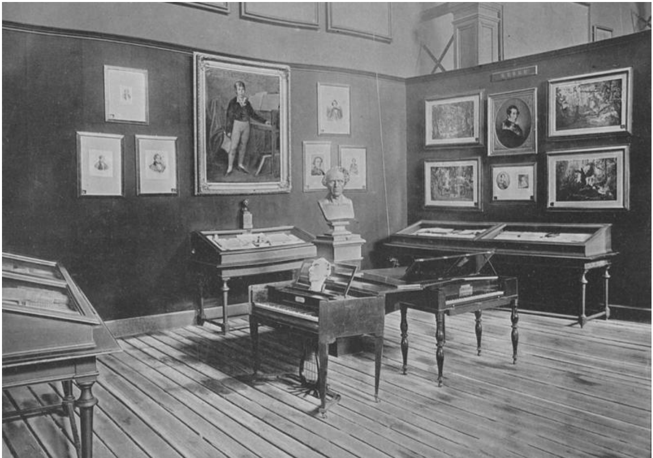
Figure 8: Weber and Meyerbeer interior (joint interior), depicted in Schneider, Internationale Ausstellung Wien 1892, 115