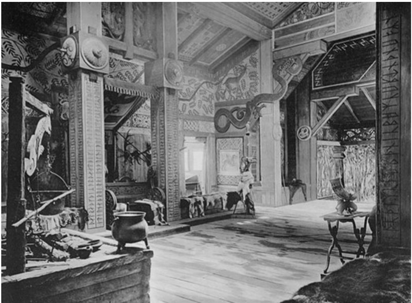
Figure 11: Hall of the Gibichungs, depicted in Schneider, Internationale Ausstellung Wien 1892 , 153

With the construction and furnishing of the Hall of the Gibichungs , the aim was to illustrate, as faithfully as possible, a picture of a German princely house from the first centuries of our era. In addition, the decoration was chosen in such a way that it should stimulate study of the German legend, which unfortunately is not yet as generally recognized as it deserves due to its deep, ethical content. ... All ornaments are reproduced as precisely as possible from the grave findings and the oldest art monuments. On the walls, there are trophies and weapons of the landlord and his ancestors, on and next to the frames are household items, adventurous horns, antlers and bones, including the tusks of the narwhal, which has always been talked about so much and which is still often used for defense by the legendary unicorn. The curtains and canopies are made according to the Old Frisian miniatures, which correspond to the old grave finds in their ornamentation and representation. [68]