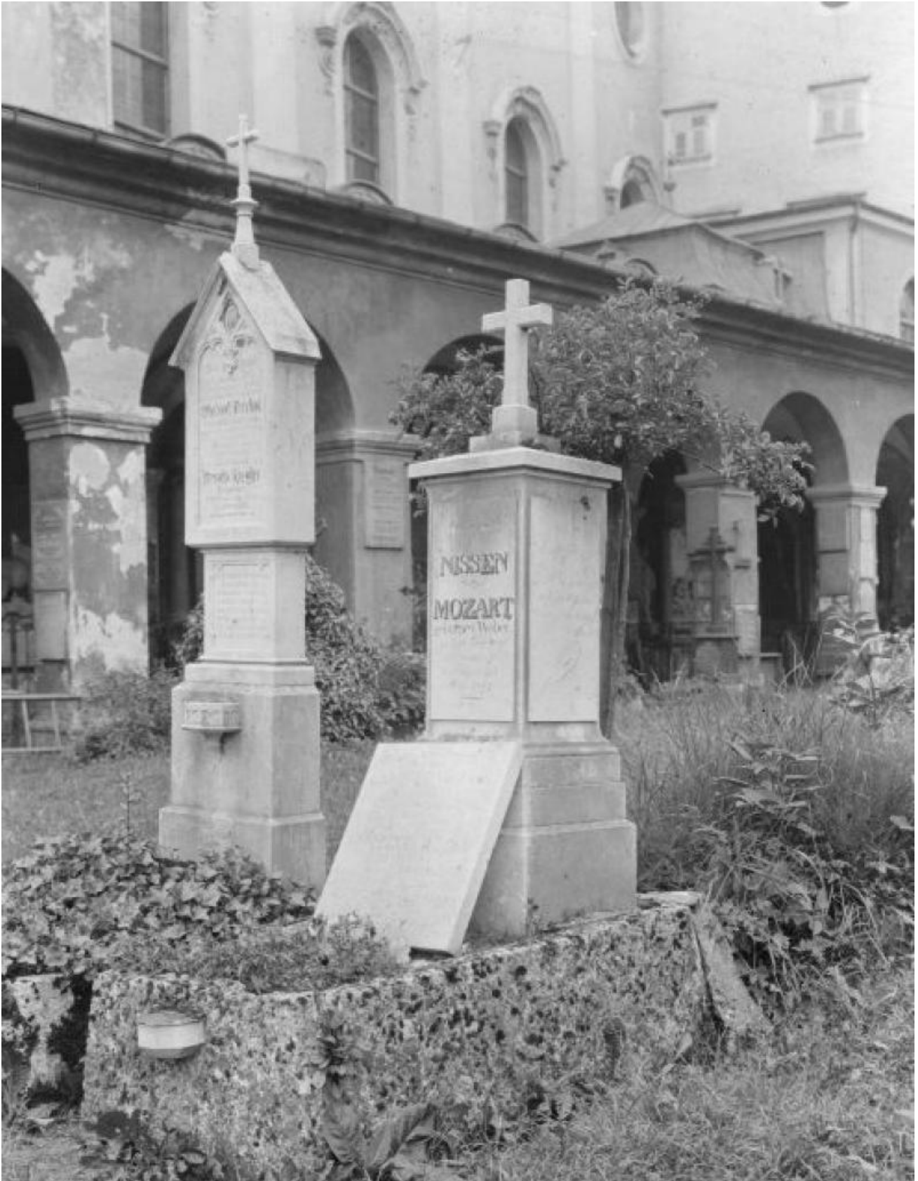
Figure 4: Representative grave of the Mozart family, funded by Johann Evangelist Engl (ca. 1910)

[5] But there are also many mistakes to be found in relation to Salzburg: For example, it is true to say that Salzburg did not belong to Austria at that time (1783), but to claim that parts of Tyrol and Bavaria also belonged to Salzburg at that time is wrong. Here, Servatius gets the history backwards, because the cession of territory to Bavaria only took place in the course of the reorganizations following the Congress of Vienna, the combination with Tyrol in the Salzach