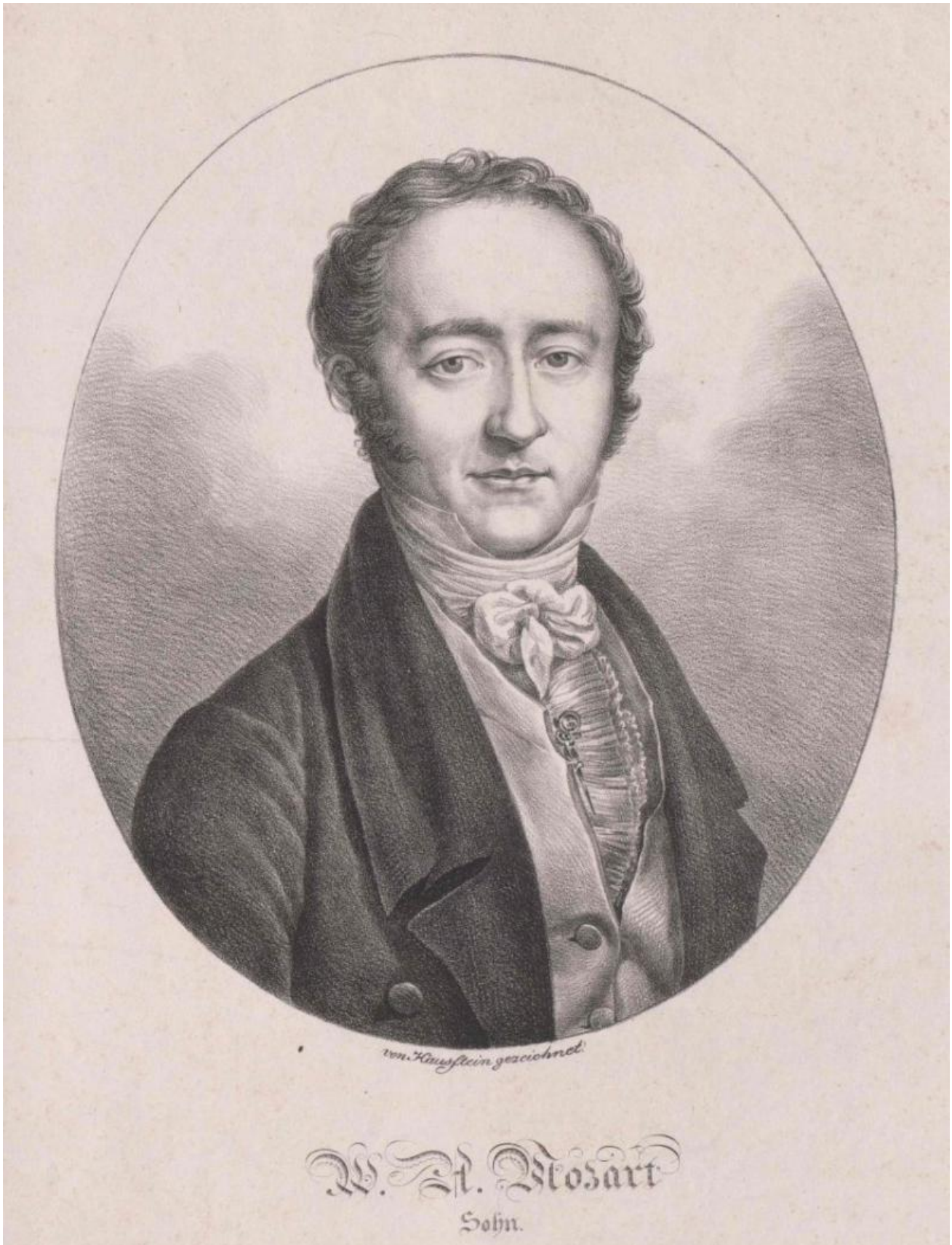
Figure 3: Franz Xaver Wolfgang Mozart

Servatius cannot fail to mention Constanze Mozart's misconduct in the matter of Mozart's grave (165-67, 473-74), in the Requiem dispute (175-79, 389-94, and repeatedly in between), the Hummel affair (455-58), and in various publishing matters. Even here she does not manage—despite the overwhelming source and research material—to force herself to deliver an