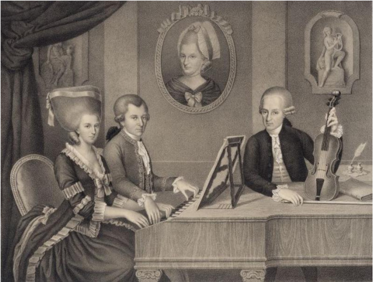
Figure 1: Wolfgang Amadeus Mozart making music with his father Leopold and his sister Maria Anna (lithograph by Eduard Friedrich Leybold after a painting by Johann Nepomuk della Croce)