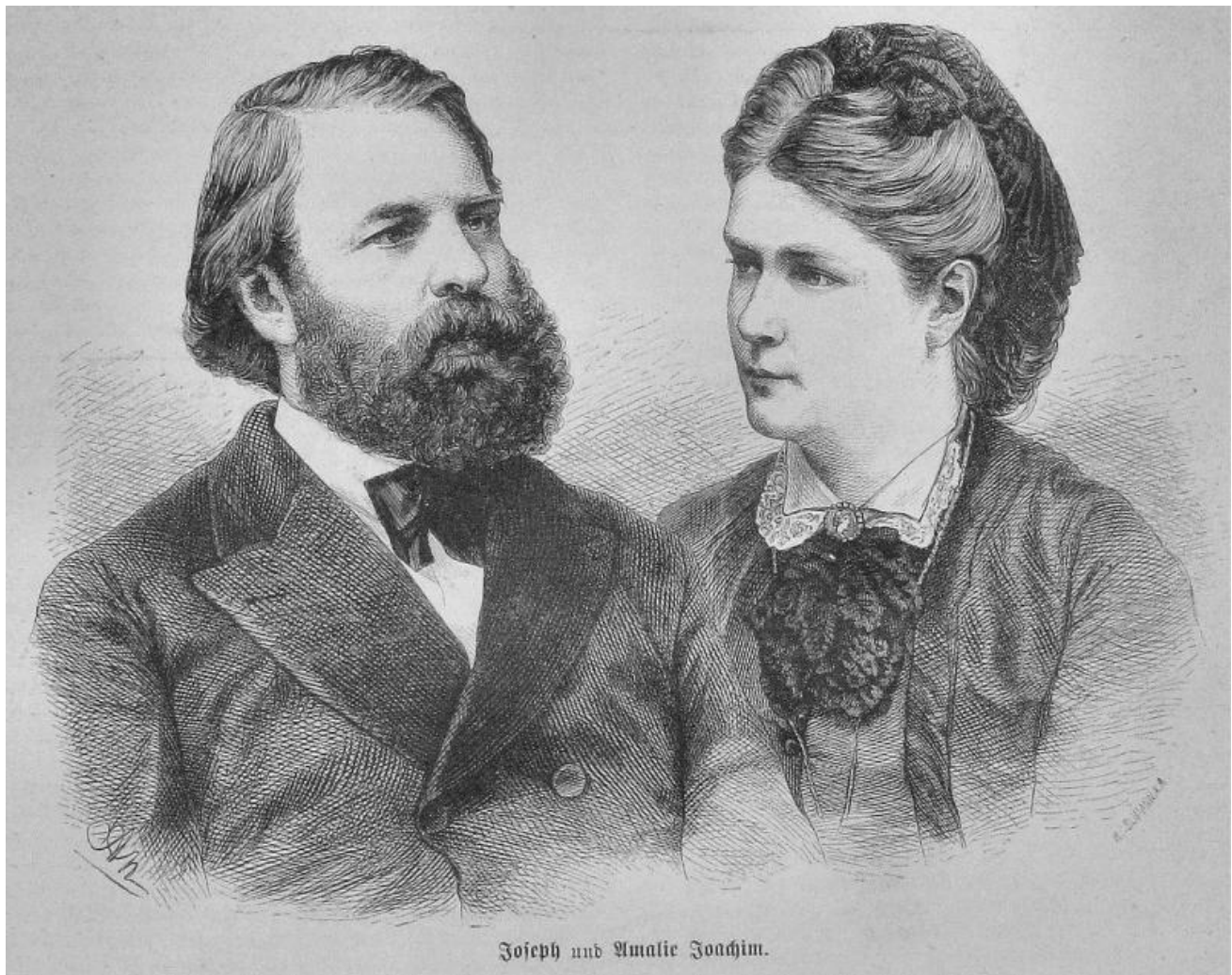
Figure 3: Joseph and Amalie Joachim, wood engraving by Adolf Neumann (1825–84), in Die Gartenlaube 21, no. 38 (1873): 611