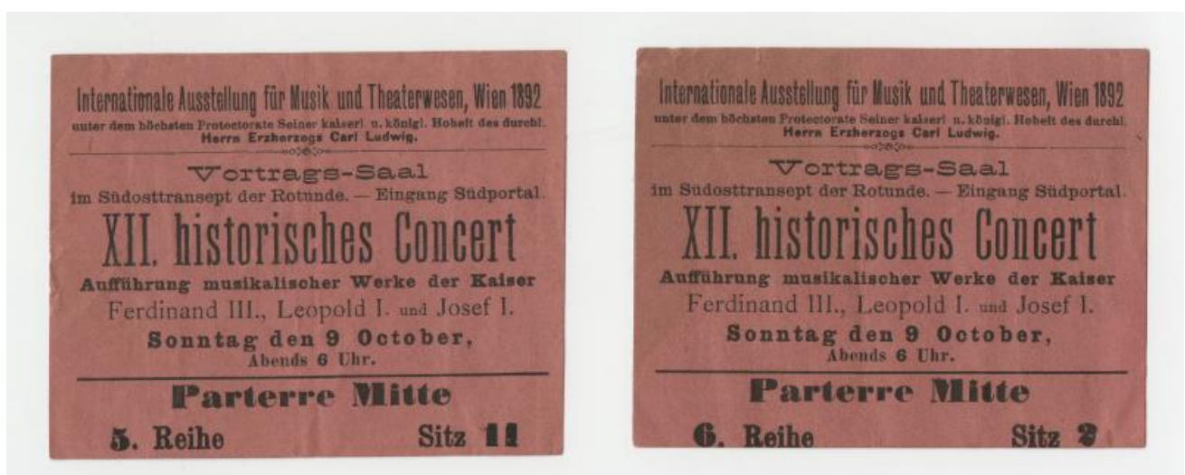
Figure 4: Image of the invitation-entrance to the last concert of the Historische Concerte ; Guido Adler Papers, University of Georgia, Box 53, Folder 11

The last of the Historische Concerte follows the fourth type of early concert programming trends. It differs from the other concerts above all because it was private. It was not open to the public and visitors of the exhibition like the other concerts. The attendants needed to be invited by the emperor.