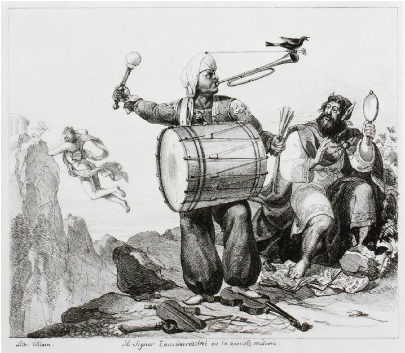
Figure 2: Il Signor Tambourossini, ou la nouvelle mélodie (1821), lithograph by Paul Delaroche

Berlioz, conducting an orchestra-as-army, is depicted in a comparable caricature by Andreas Geiger in 1846, equally reflecting the controversy around the new musical generation. [58]