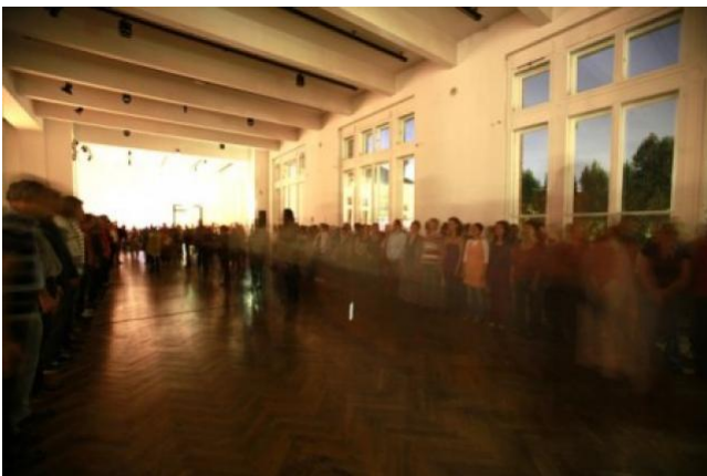
Figure 3: “VARIETIES” at MAK, Vienna

[5] The main compositional concept of the piece was to create the parts for a mixed choir out of two vocal solo parts with the help of audio scores during the performance. The sound passes via headphones from the soloists to the lead singers, and within the choir from one singer to the next. There is no need for a conductor. While singing their notated parts independently, the two soloists follow a timeline. A male and female singer equipped with headphones lead the choir. Microphones transmit the solo voices into the headsets of the lead singers. Everybody is asked to perform exactly what he or she hears as accurately as possible. “Instead of reading music,