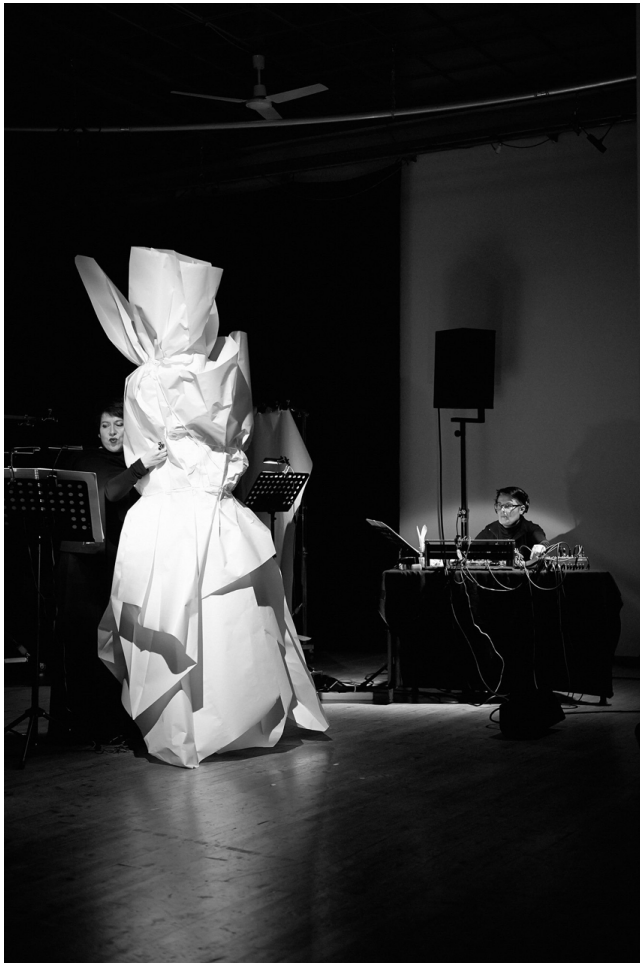
Figure 4: "BUT STILL ATTACHED TO LIFE AT ALL FOUR CORNERS", December 31, 2013 (premiere)

The piece's communicative structure is characterised by the alternating parts of the musicians. A large paper sculpture dominates the scene. Recalling the traditional posture of an opera singer, it alludes to opera on the visual level, too. Pia Palme made the sculpture herself "by wrapping a mannequin puppet with moulded layers of simple wrapping-paper". As she explained, it serves as an instrument as well: "The singer stands behind the sculpture and uses it as a versatile percussion instrument, to be treated with precisely timed movements notated in the score. [...] The live electronic setup is partially controlled by feathers moved over light sensors". [51]