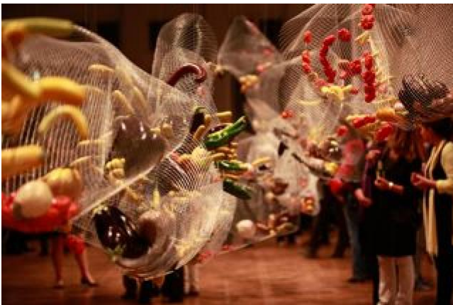
Figure 2: “VARIETIES” at MAK, Vienna