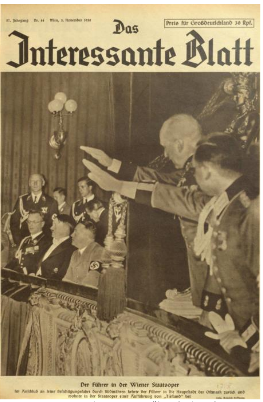
Figure 1: Der Führer in der Wiener Staatsoper Das Interessante Blatt, November 3, 1938

value of this list, however, is limited due to the omission of repeated performances whose cast was only slightly different. Another example is the record of the guests at the Opera Ball on January 15. Here, Stoy provides two pages with the names of a total of 82 persons, including their titles and the people accompanying them, but he does not provide any analysis that might have given this long list of names some sort of systematic order (84–85). For valuable information such as this, an editorial approach might have been more appropriate. In its execution, the book seems less a systematic analysis based on guiding questions, but more like an encyclopedia.