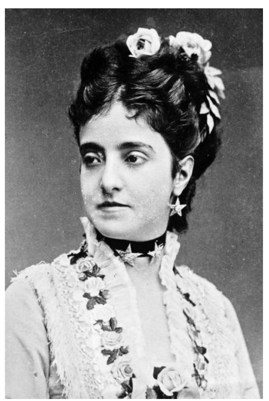
Figure 2: Adelina Patti (private portrait)

[4] Markéta Štědronská's editorial work on the volume is outstanding in every respect. Each of the 138 items reprinted here is numbered for ease of reference or cross-reference (cross-referenced items in the editorial notes give this number and individual text-line numbers, as appropriate). The layout of the primary text resembles that of the Hanslick Sämtliche Schriften edition of Dietmar Strauß et al. (no longer to become sämtlich , sadly). The original periodical publication data is indicated at the start of each entry, followed by the original heading of the item, authorial attribution (whether by cipher, full name at the beginning or end of the piece, or without attribution), and the main text, largely preserving original orthography and typographical format, is provided with line numbers. In the Hanslick edition line numbers are provided only where later reprintings during the author's lifetime provide textual variants, listed at the end of each entry. Since Ambros's journalism was mostly not reprinted, apart from selections taken over in the second volume of the essay collection, Bunte Blätter: Skizzen und Studien für Freunde der Musik und der bildenden Kunst (Leipzig: Leuckart, 1874), Štědronská dispenses with textual