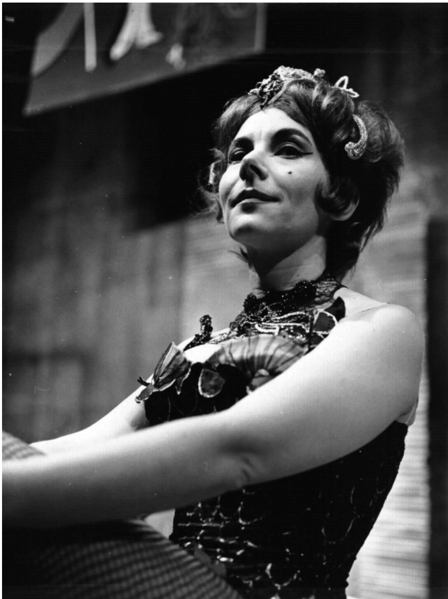
Figure 3: Lulu , Portrait

[13] Berg himself came to the same conclusion regarding the symmetry of the husbands and clients in the same letter to Schoenberg (dated August 7, 1930), where he spoke about appropriating the Wedekind text: "The orchestral interlude [the FMI], which in my version bridges the gap between the last act of Erdegeist and the first of Büchse der Pandora [the two Lulu plays by Wedekind that Berg merged into his opera], is also the focal point for the whole tragedy and—after the ascent of the opening acts (or scenes)—the descent in the following scenes marks the beginning of the retrograde. (Incidentally: the 4 men who visit Lulu in her attic room are to be portrayed in the opera by the same singers who fall victim to her in the first half of the opera. In reverse order, however.)" [137] Berg's letter is intriguing because he formulated the cyclical course of his operatic narrative in 1930, which was well before he had come to compose the final scene. Most significantly of all, he was well aware, even in those early stages, that Lulu was meant to be in two distinct parts: an ascent and a descent, demarcated by a central interlude that would trigger the retrograde.