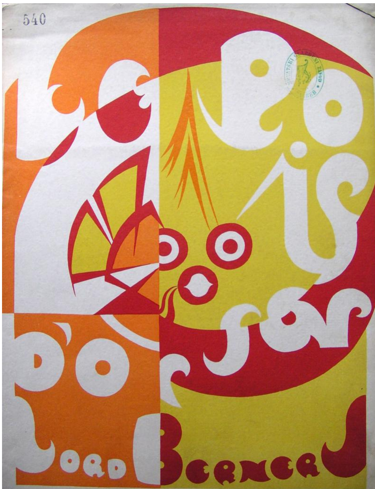
Figure 4: cover of Le poisson d'or by Lord Berners, illustrated by Natal'ya Gončarova, 1919