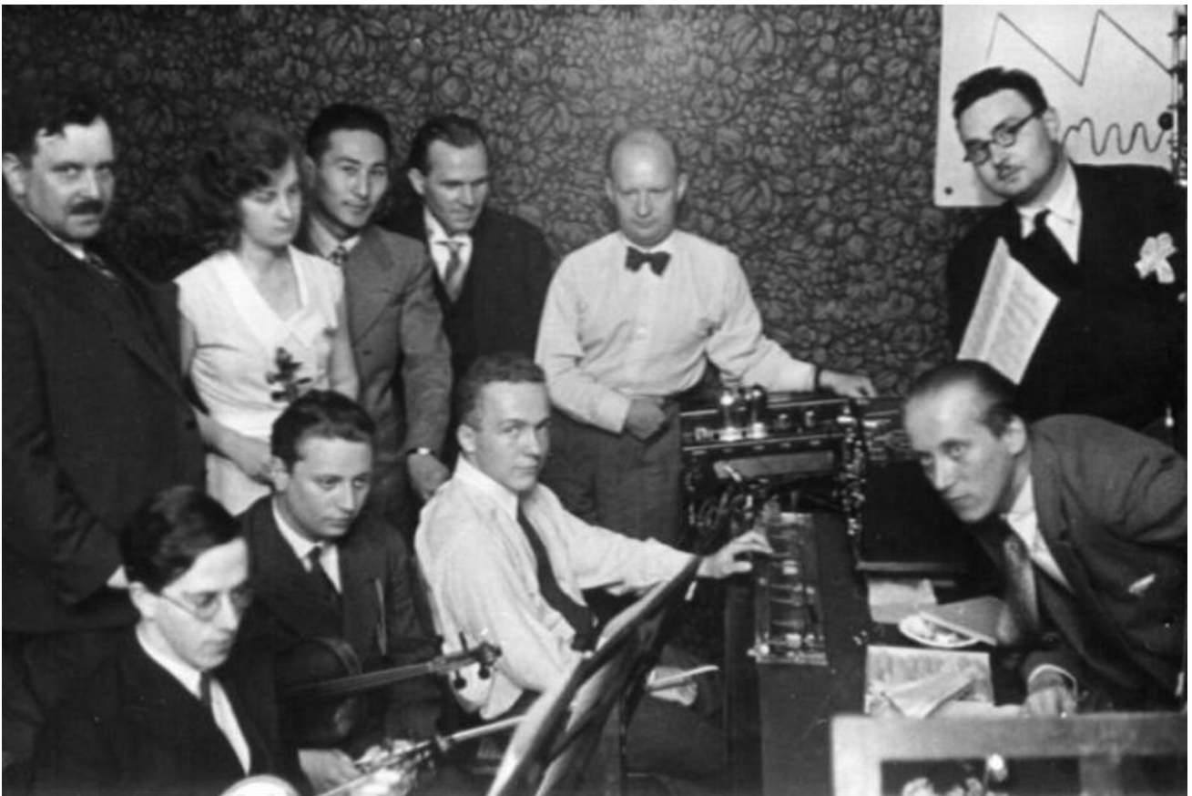
Figure 2: Friedrich Trautwein (1888–1956) with Paul Hindemith and his class at the Trautonium, Rundfunkversuchsstelle Berlin