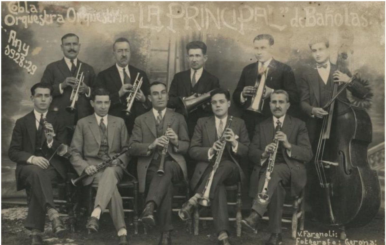
Figure 4: Image of a cobla (La Principal de Banyoles) in 1928; by courtesy of Arxiu Comarcal Alt Empordà, Biblioteca de Catalunya, No. ACAE110-45-N-15608

Like Roberto Gerhard (1896–1970), Stravinsky, and other modernist composers in the interwar period, Mayer-Serra praised the “nasally penetrating” sound of the wind instruments in the cobla (i.e. far distanced from the string-laden sound of Romantic music). Unlike them, he strongly emphasized the links of the contemporary Catalan choral movement with nineteenth-century class struggles, portraying the composer Josep Anselm Clavé (1824–74), the “founder” of the choral movement, as a kind of proletarian hero. [71] Significantly, Mayer-Serra never mentioned the political conservatism and eminently bourgeois nature of most choral societies in Catalonia, in particular the Orfeó Català (to which he was closely linked, even during the war).