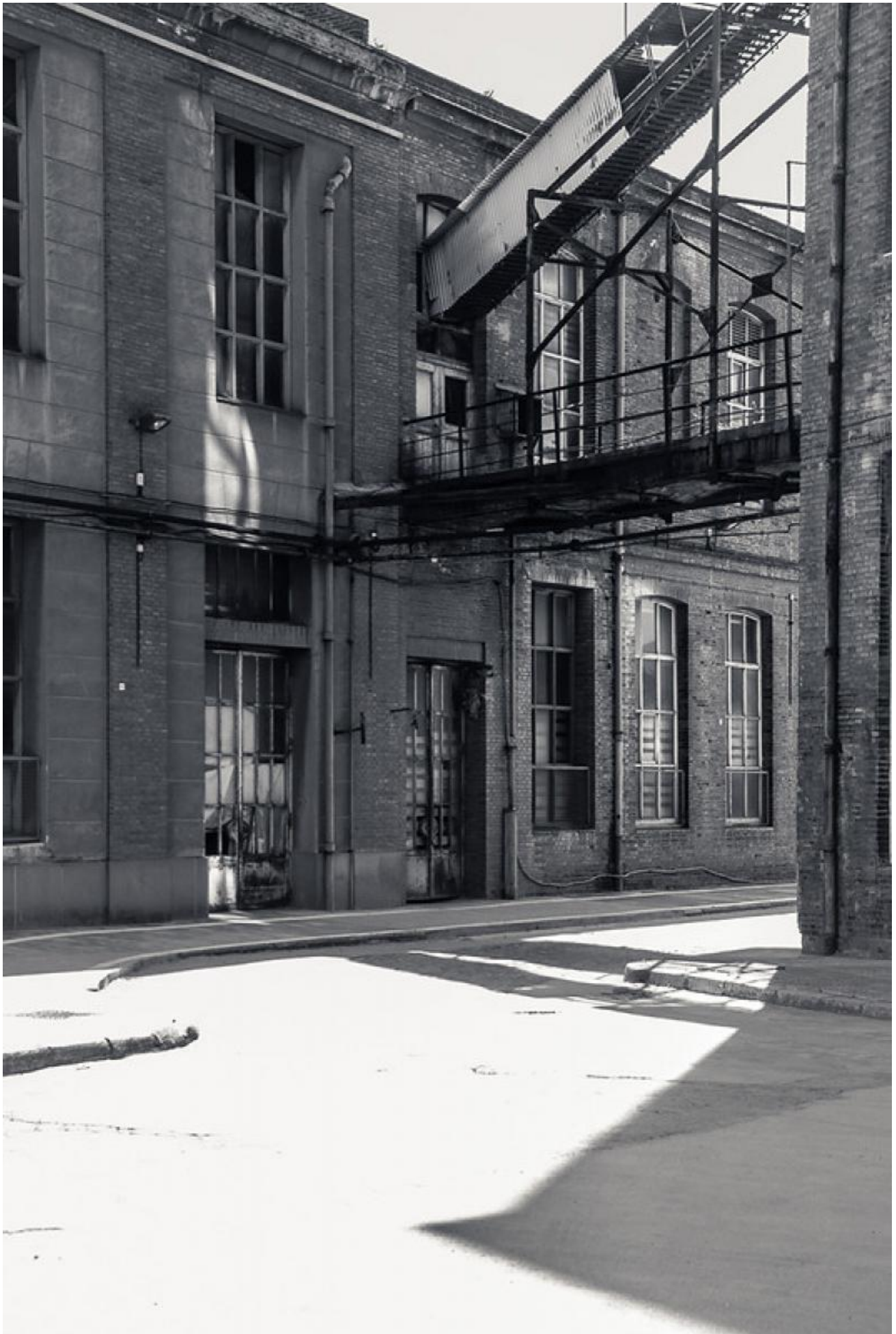
Figure 5: Outside view of the factory Fabra i Coats in Barcelona, where the workers'